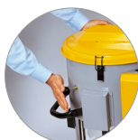
Manual filter shaking system